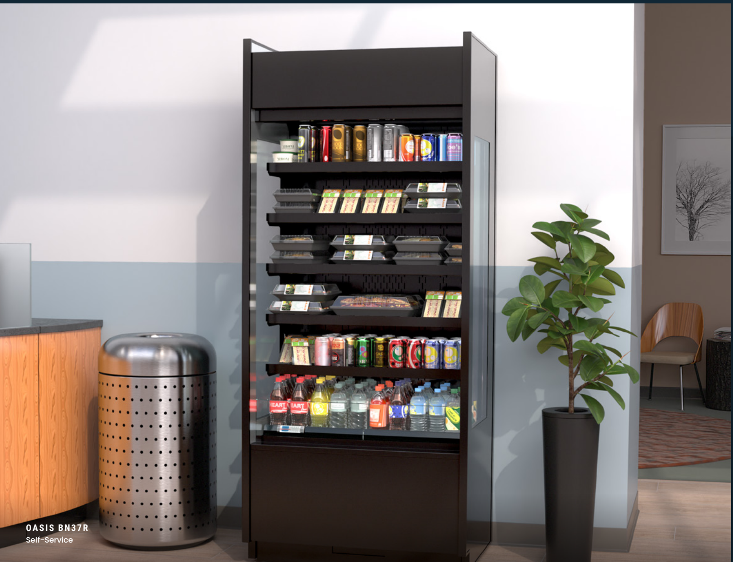
OASIS BN37R Self-Service

Enhance the presentation of more food options by providing a mix of service and self-service options , such as scalable micromarket formats , to meet the needs of convenience-seeking diners .