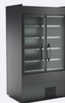
OASIS BD4732 Self-Service