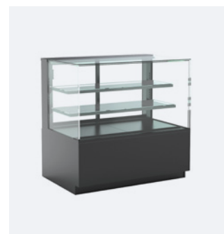
REVEAL NR4847RSV Counter