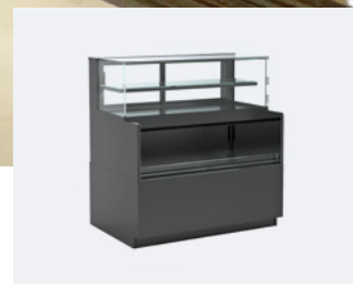
REVEAL NR6051RRSSV Combination

Combination models optimize floor space with multiple display areas in a single piece of equipment, providing flexibility to offer a variety of fresh foods within different methods for serving the customer.