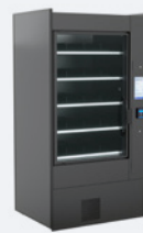
ELEVATE BD36321S Self-Service

Provide a cashier-less experience and increase the speed and accuracy of transaction for those looking for a convenient 24/7 fresh food selection. Offset labor challenges, create an appealing merchandising format with increased capacity, and seamlessly streamline inventory management to serve food deserts across healthcare facilities and office spaces.