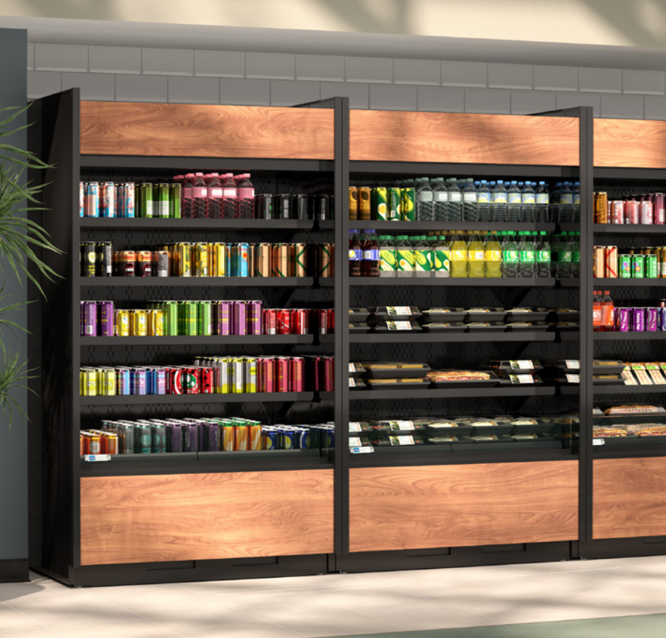
OASIS B47R Self-Service