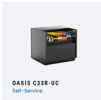
OASIS C33R-UC Self-Service