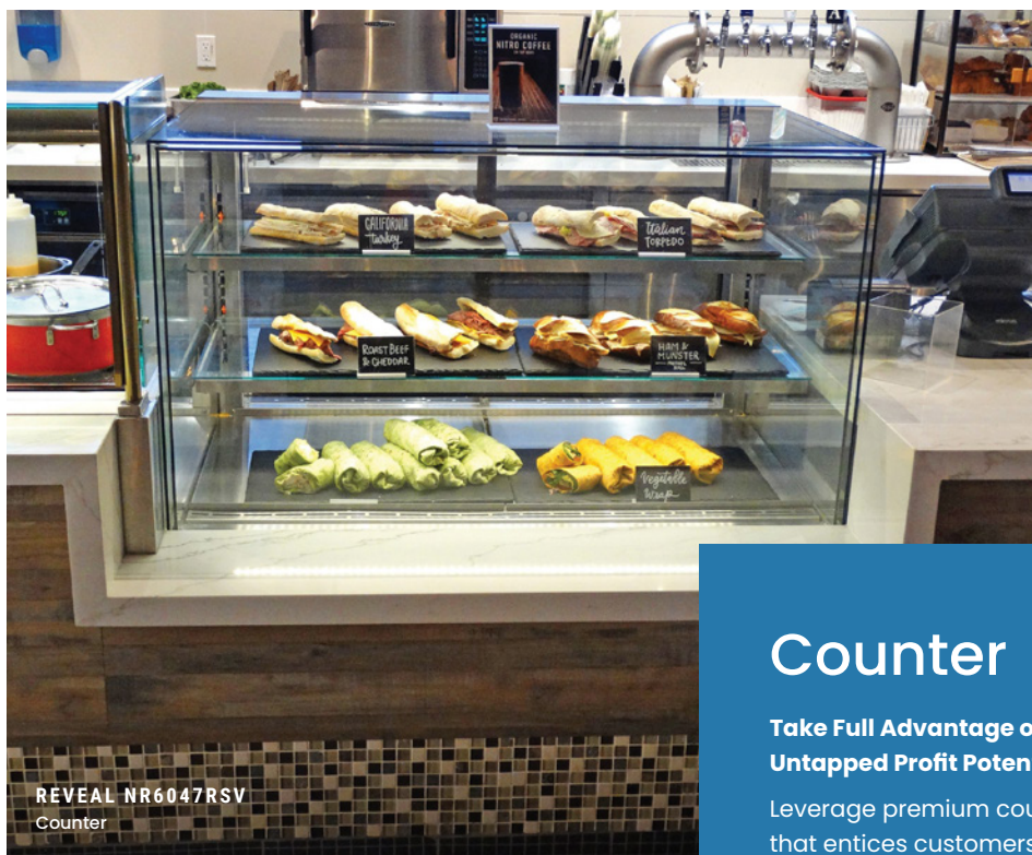
REVEAL NR6047RSV Counter

The shape of these display cases makes them ideal for integrating into counters so that all customers see is fresh food/beverages making these modular units the perfect grab-and-go solution.