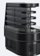
OASIS FSE460R Endcap

Utilize displays that blend into high traffic areas to generate incremental sales.