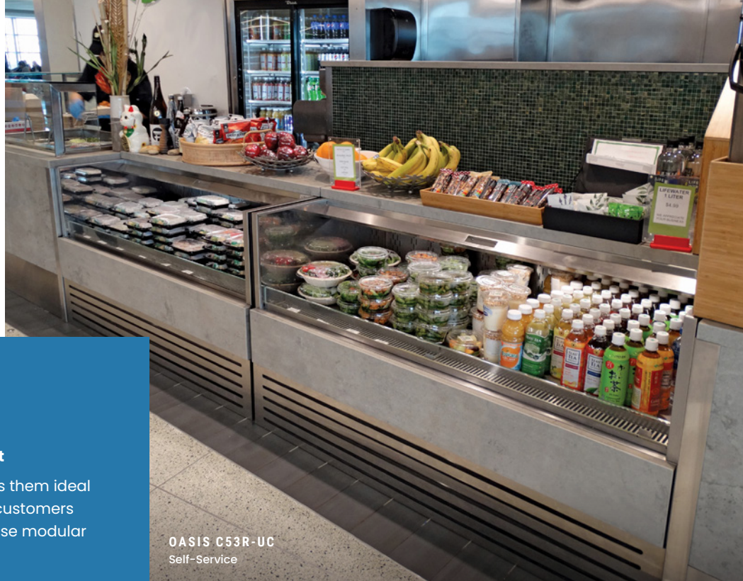
OASIS C53R-UC Self-Service