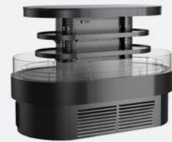
OASIS FSI660R Island

Easily create impulse-buy sites with self-contained refrigerated islands.