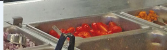
OASIS B6624 Service

2022 State of the Restaurant Industry, National Restaurant Association