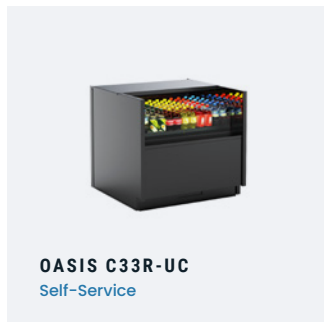
OASIS C33R-UC Self-Service