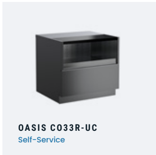
OASIS C033R-UC Self-Service