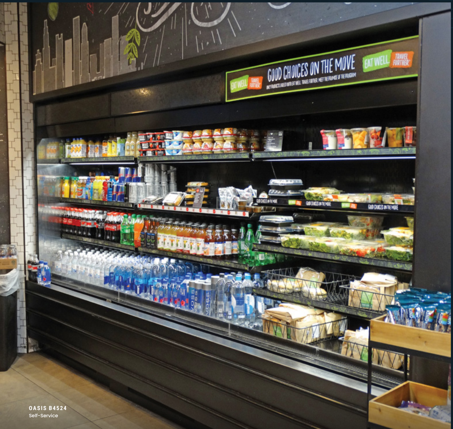
OASIS B4524 Self-Service

Restaurants have long relied on Structural Concepts as a resource for innovative, wide-ranging unit designs and convenient service formats that fit most applications to help them remain competitive .