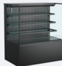
REVEAL NR3655RSSV Counter