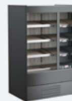
OASIS B3924RH Combination

The refrigerated & heated self-service case provides a vertical combination of grab & go refrigerated and heated display offering both hot and cold temperatures in the same case.