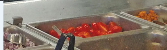
OASIS BN57R Service

2022 State of the Restaurant Industry, National Restaurant Association