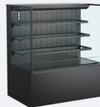
REVEAL NR3655RSSV Counter