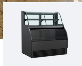
HARMONY HMBC6 Combination

Combination models optimize floor space with multiple display areas in a single piece of equipment providing flexibility to offer a variety of fresh foods within different methods for serving the customer.