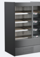
OASIS B3924RH Combination

The refrigerated & heated self-service case provides a vertical combination of grab & go refrigerated and heated display offering both hot and cold temperatures in the same case.