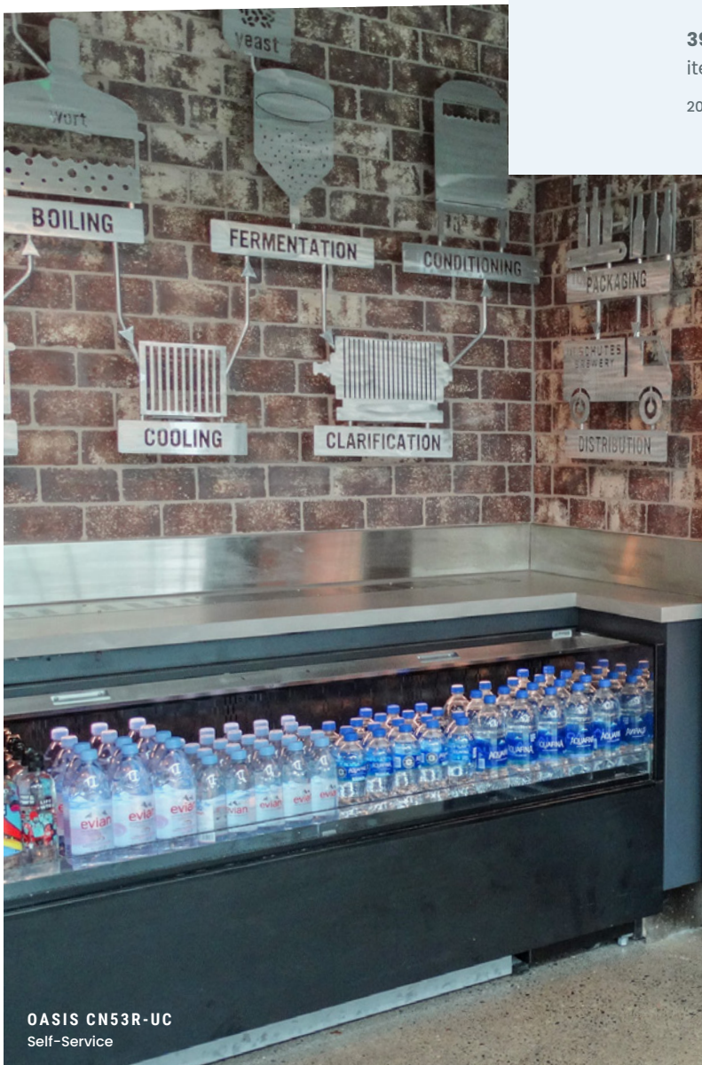
OASIS CN53R-UC Self-Service

2022 State of the Restaurant Industry, National Restaurant Association