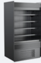
OASIS B4732 Self-Service

Stimulate sales by offering a variety of grab & go options with self-service cases to accommodate modern consumer's fast-paced lifestyle and desire to make speedy selections and transactions.