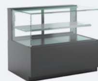
REVEAL NR4840RSV Service

Keep food fresh longer within a fully enclosed display and interact with customers to provide a high level of service and satisfaction.