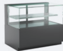
REVEAL NR4840RSV Service

Keep food fresh longer within a fully enclosed display and interact with customers to provide a high level of service and satisfaction.