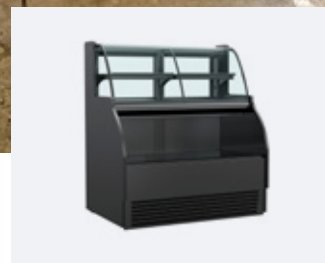
HARMONY HMBC6 Combination

Combination models optimize floor space with multiple display areas in a single piece of equipment providing flexibility to offer a variety of fresh foods within different methods for serving the customer.