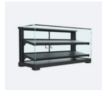
IMPULSE CGSV4522 Counter