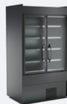
OASIS BD4732 Self-Service