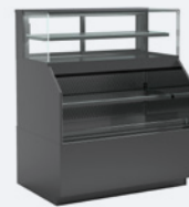
REVEAL NR4851RRSSV Combination

Combination models optimize floor space with multiple display areas in a single piece of equipment, providing flexibility to offer a variety of fresh foods within different methods for serving the customer.