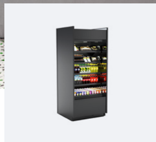
OASIS B47R Self-Service

Stimulate sales by offering a variety of grab & go options with self-service cases to accommodate modern consumer's fast-paced lifestyle and desire to make speedy selections and transactions.