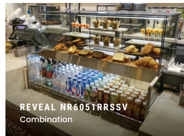
REVEAL NR6051RRSSV Combination

A case that offers multiple display areas to optimize floor space. Choose from refrigerated, non-refrigerated, prep and grab & go combination models available in various lengths and styles perfect for varying day part menus.