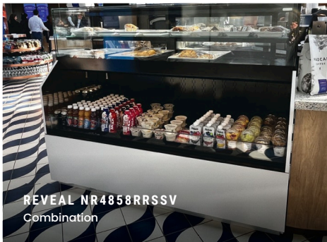
REVEAL NR4858RRSSV Combination