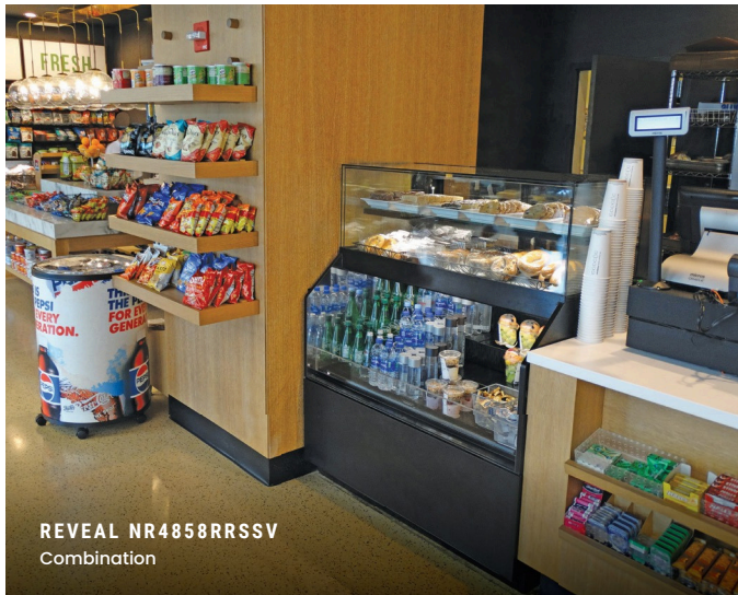
REVEAL NR4858RRSSV Combination

This thoughtful design forms ample air space between glass panes to provide the insulation needed to prevent condensation and allows the glass-to-glass seams of the box to virtually disappear, eliminating any distraction from the food inside.