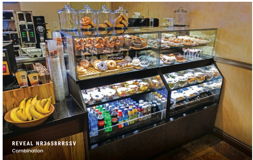
REVEAL NR3658RRSSV Combination