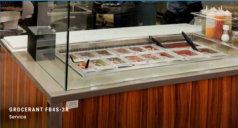
GRO CERANT FB4S-3R Service