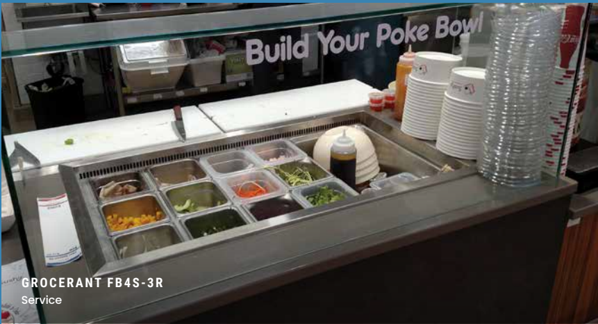
GRO CERANT FB4S-3R Service

Refrigerated or heated, Grocerant service and self-service cases present favorites like yogurt parfaits, soups, and a variety of side dishes in a way that preserves freshness.