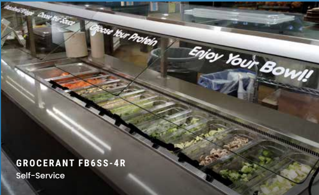
GRO CERANT FB6SS-4R Self-Service