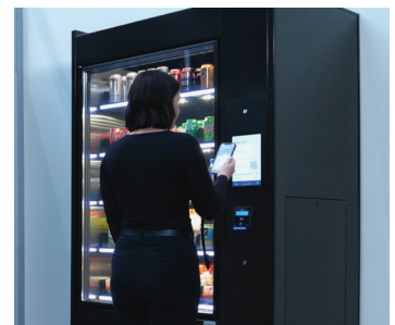
If the consumer is done shopping, they can either tap the "pay" button on the tablet screen or just walk away.

If an item gets put back, it gets removed from the cart. If the item is put back in the wrong place, an alert is offered to the customer that the item has been placed in the incorrect spot and is still in their shopping cart until it is put back in the appropriate space.