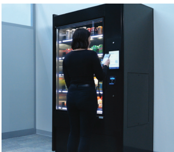
The consumer presents a payment method.