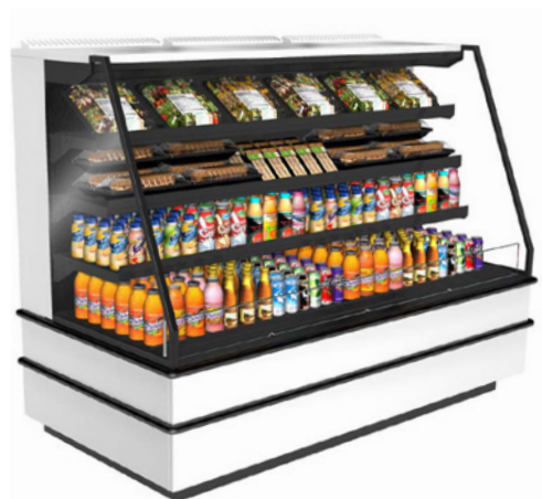
BLEND NM7255RSSA Self-Service