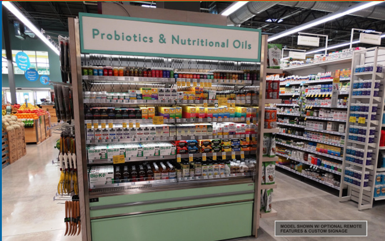
MODEL SHOWN W/ OPTIONAL REMOTE FEATURES & CUSTOM SIGNAGE